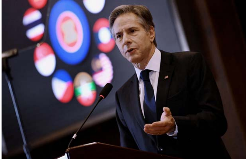
A visit by US Secretary of State Antony Blinken to Jakarta, Indonesia, in December 2021 was part of the US' attempt to gain more influence in the country and region at large.

For its part, the US under Biden has not broken with the Trump administration's position of seeing China as a strategic competitor, but Biden has put more focus on avoiding conflict and cooperating with China on the global economy and climate change . The Asean Outlook creates further common ground for China and the US. There is considerable room for future exploration.